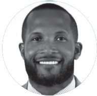
Champ Bailey Pro Football Hall of Fame