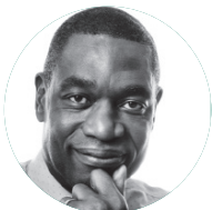
Dikembe Mutombo Pro Basketball Hall of Fame