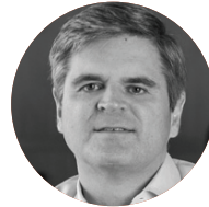
Steve Case Chairman The Case Foundation