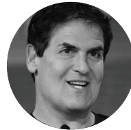
Mark Cuban ABC's Shark Tank Owner, Dallas Mavericks