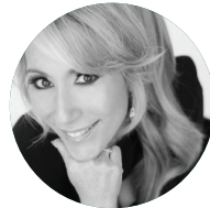
Lori Greiner The Warm Blooded Shark™