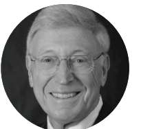
Bernie Marcus Chairman The Marcus Foundation