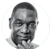
Dikembe Mutombo Pro Basketball Hall of Fame