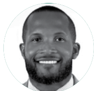
Champ Bailey Pro Football Hall of Fame