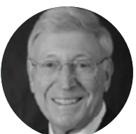
Bernie Marcus Chairman The Marcus Foundation