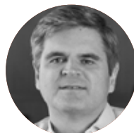
Steve Case Chairman The Case Foundation