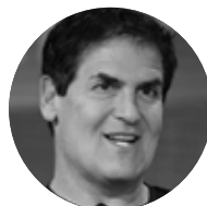
Mark Cuban ABC's Shark Tank Owner, Dallas Mavericks