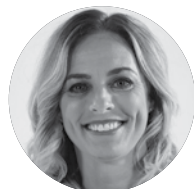
Nicki Collen Head Coach Atlanta Dream