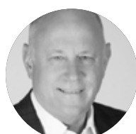
Jeff Sprecher Chairman, New York Stock Exchange