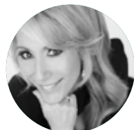
Lori Greiner The Warm Blooded Shark™