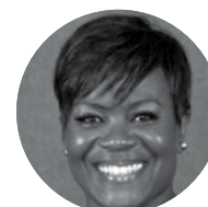
Sheryl Swoopes Pro Basketball Hall of Fame