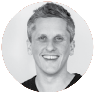
Aaron Levie CEO, Co-Founder & Chairman, Box